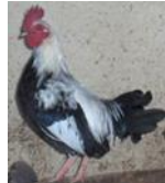
Old English Game