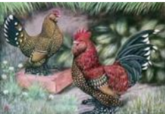
Mille Fleur Booted Bantams

These birds are a variety package. We have a number of breeds that are available. Sorry no choosing and they come unsexed only. The following pictures are only a sample of the breeds that may be in the package. The purpose of this package is to give customers a good variety of fancy chickens without having to purchase a lot of birds. This package may include different varieties of Japanese, different varieties of Silkies, Sebrights, Sultans, Frygle Cochins, Bantam Cornish varieties.