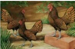
Golden Sebright Bantams